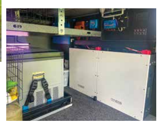
48 volt lithium batteries