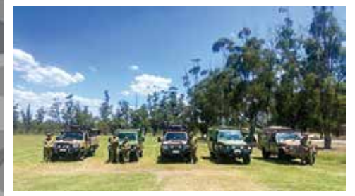
Everyman's and Sallyman vehicles & staff

Thank you for your investment into us and Defence.