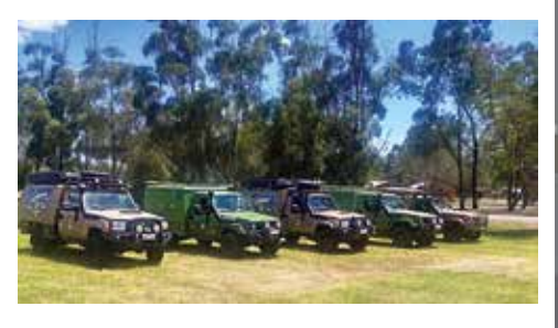
Above: Everyman's and Sallyman vehicles