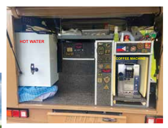
Hotwater urn & coffee machine