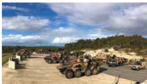
Boxer Combat Reconnaissance Vehicles operated by 214th Light Horse Regiment with EWS Brewtruck bottom RHS