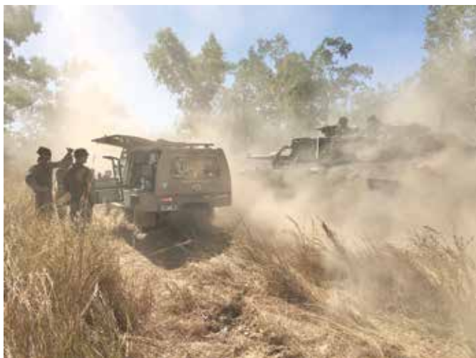
Everyman's Brewtruck in the dust of a passing tank